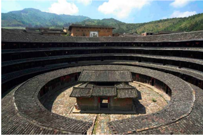
Option 1: Fujian

Creative Week: Monday 12th - Friday 16th 2018