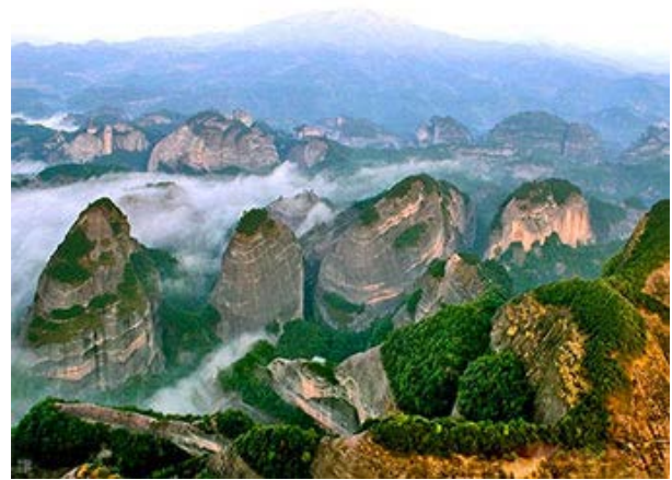
Option 2: Danxiashan